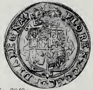
Lot No. 2849